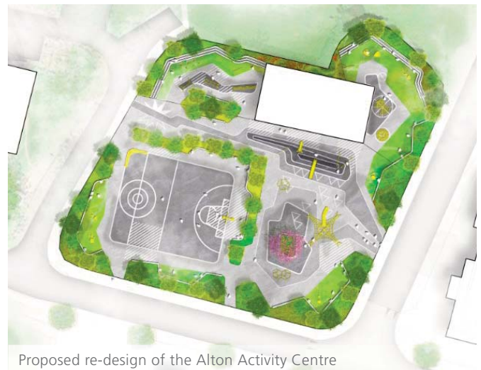
Proposed re-design of the Alton Activity Centre

the new turnaround and nearby blocks, and that the new turnaround would be obscured by mature, evergreen landscaping. Wider concerns raised about parking are shared across the estate, and a range of measures to improve the management of parking will be included in the Travel Plan which will be submitted as part of the planning application.