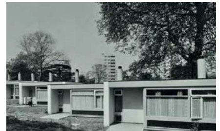
Architect's impression of the proposed development at Bessborough Road