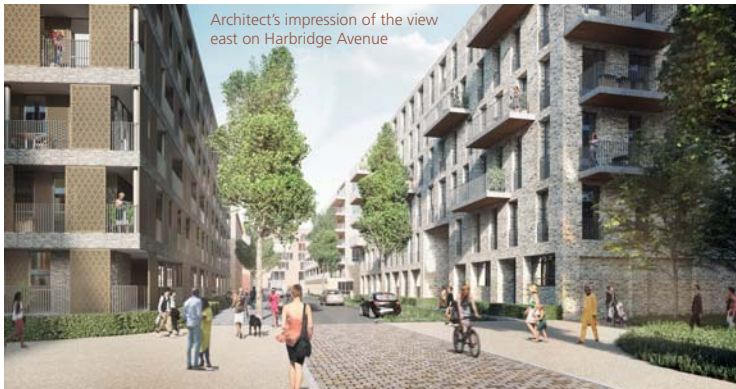
Architect's impression of the view east on Harbridge Avenue