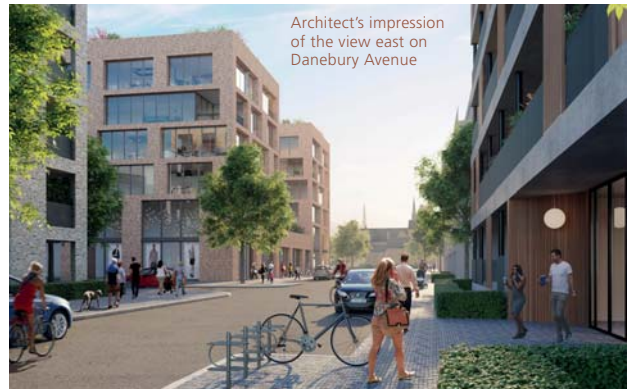
Architect's impression of the view east on Danebury Avenue

Plans for the regeneration are now available in Roehampton Library, showing the evolving design proposals.