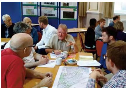
Workshop held during September in the parish hall

All feedback will be used to help shape the plans going forward over the next few months. You can also view the information online at: