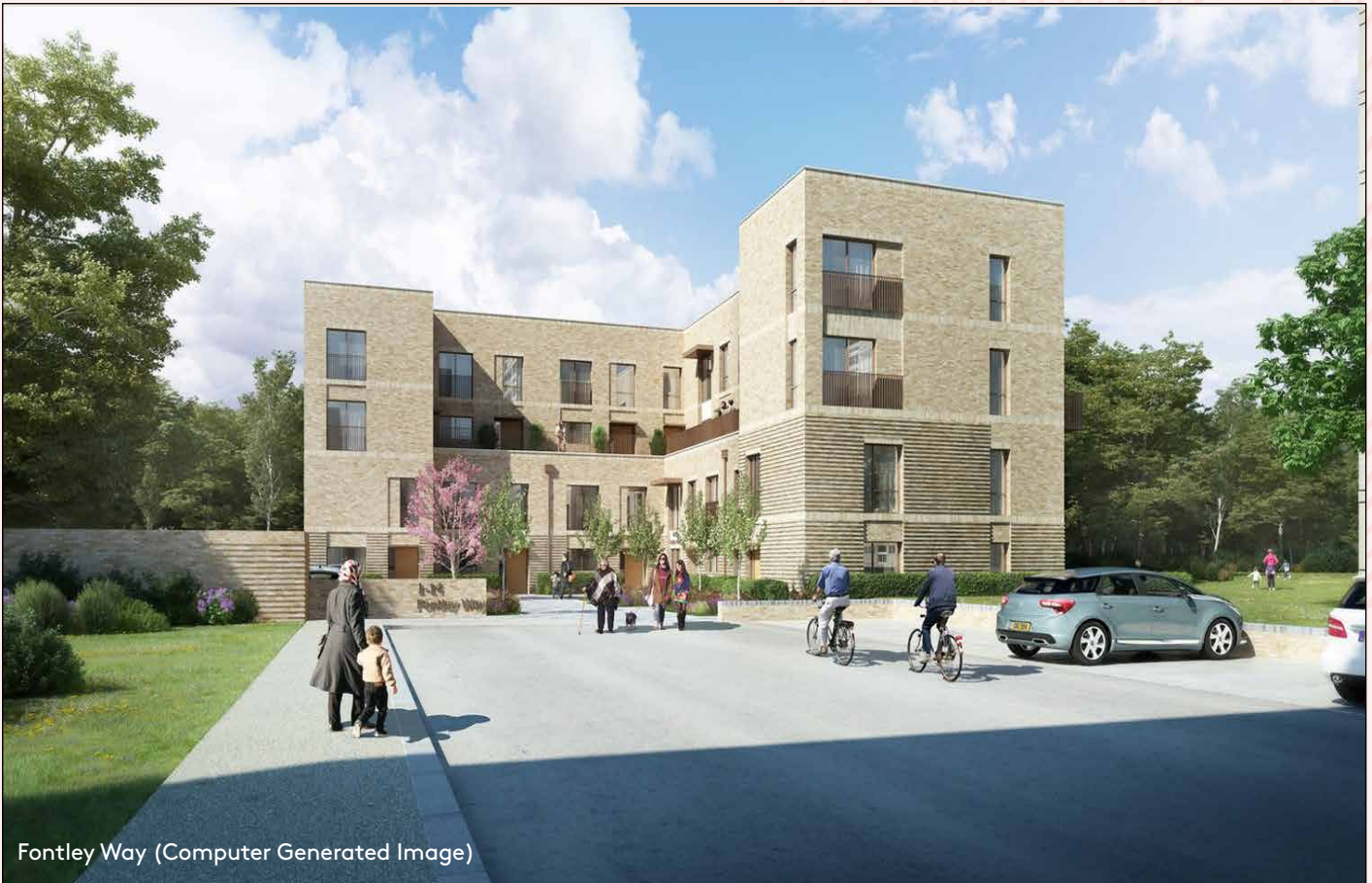
Fontley Way (Computer Generated Image)