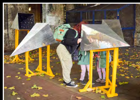
The Deconstructed Disco.

Roehampton residents have also joined the team of local people recording their night time experiences to create a playlist for a second creative project, Sounds of the Borough .