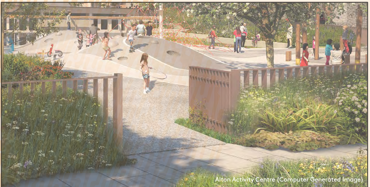
Alton Activity Centre (Computer Generated Image)

Further proposed improvements being explored are upgrades to the play spaces at the Alton Activity Centre and Downshire Field. The possible proposals for the Alton Activity Centre include the complete redesign of the external play space into zoned areas with play equipment appropriate to different age groups, as well as improved landscaping, planting and a grow garden to promote health and well-being and engage young people in food production.