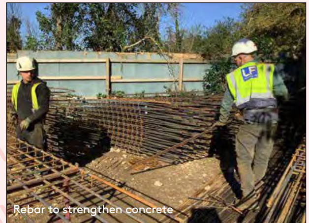
Rebar to strengthen concrete