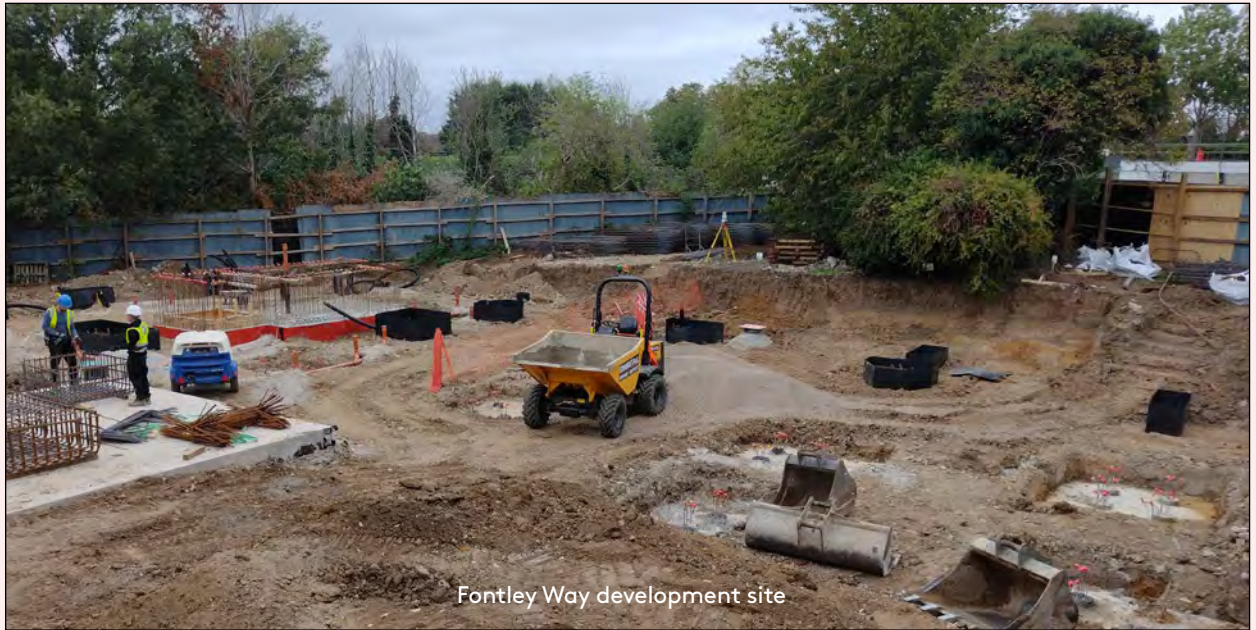
Fontley Way development site

Stay tuned for more updates in future newsletters!