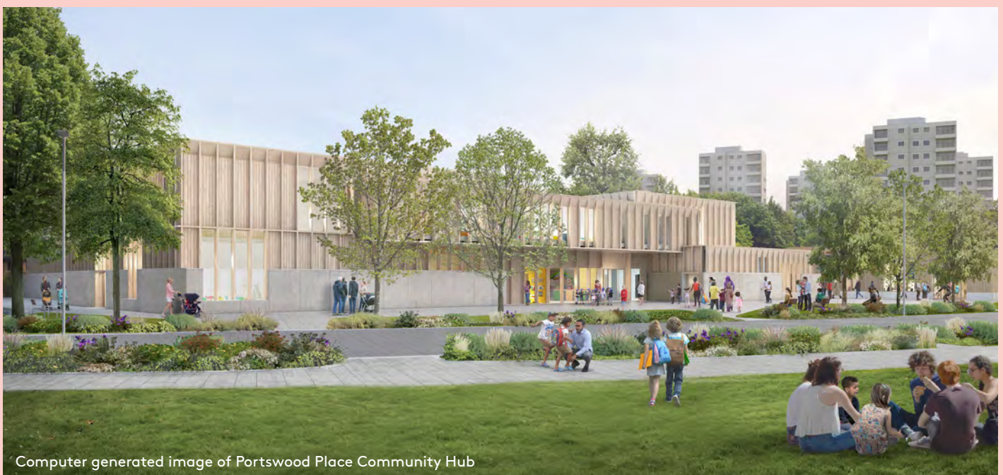
Computer generated image of Portswood Place Community Hub