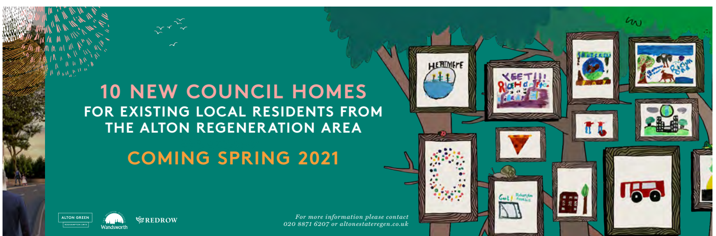
Bessborough Road hoarding